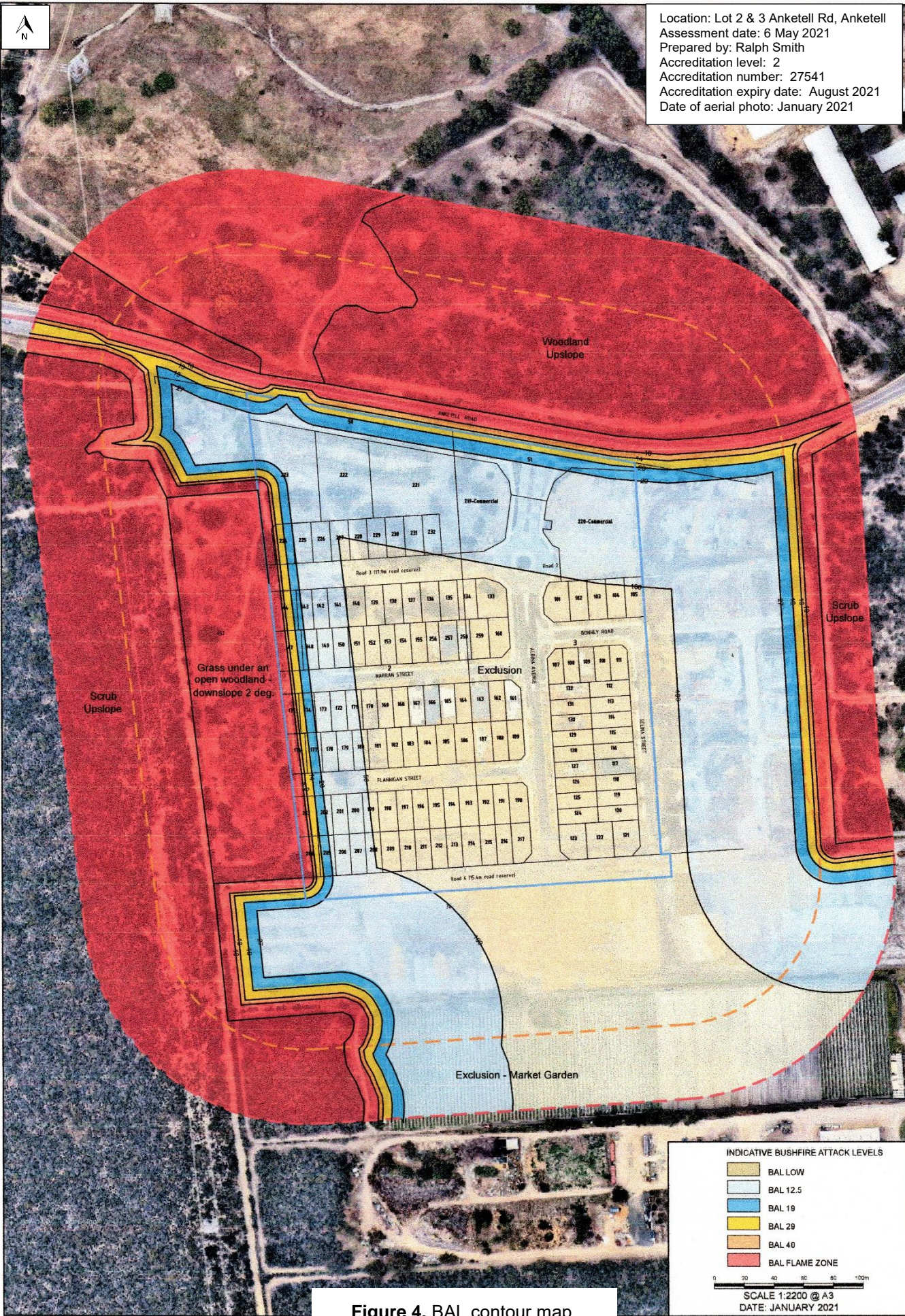
Figure 4. BAL contour map.